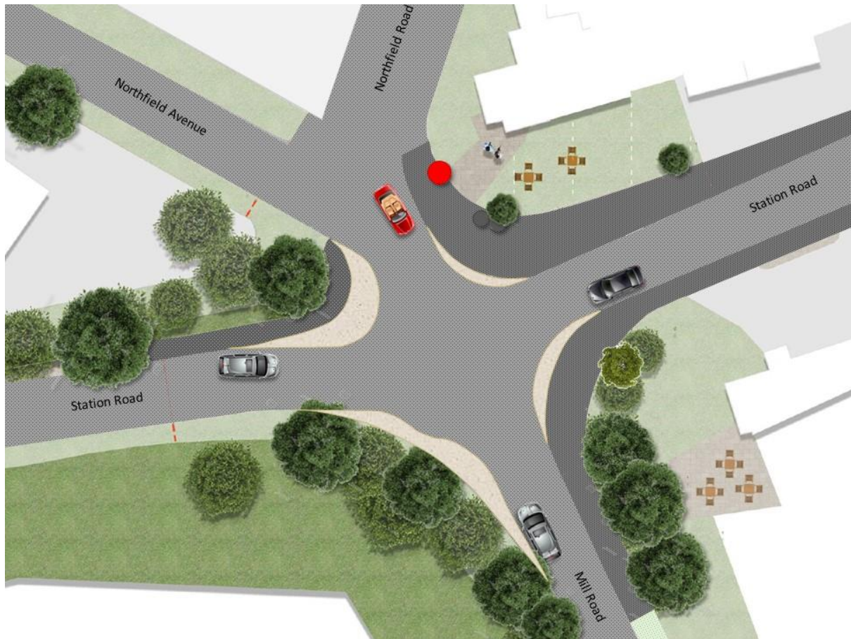
Junction, showing areas that can be reclaimed for pedestrians

The first conclusions from the study were that the location is suitable for the introduction of an informal street environment. The areas that can be reclaimed from traffic are shown below: